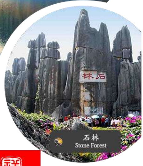
石林 Stone Forest