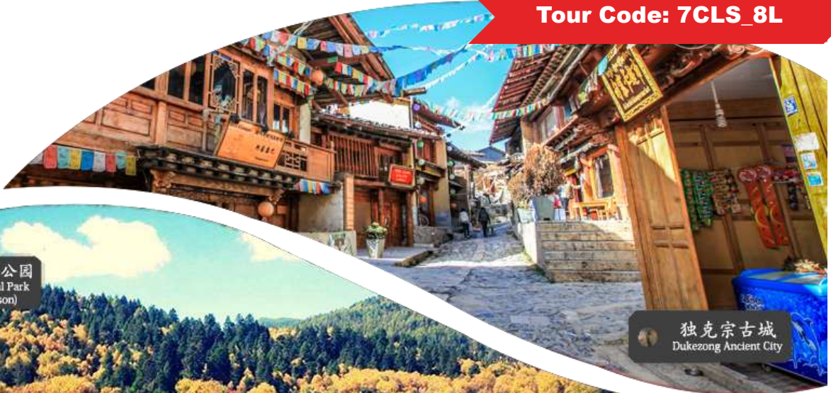
独克宗古城 Dukezong Ancient City