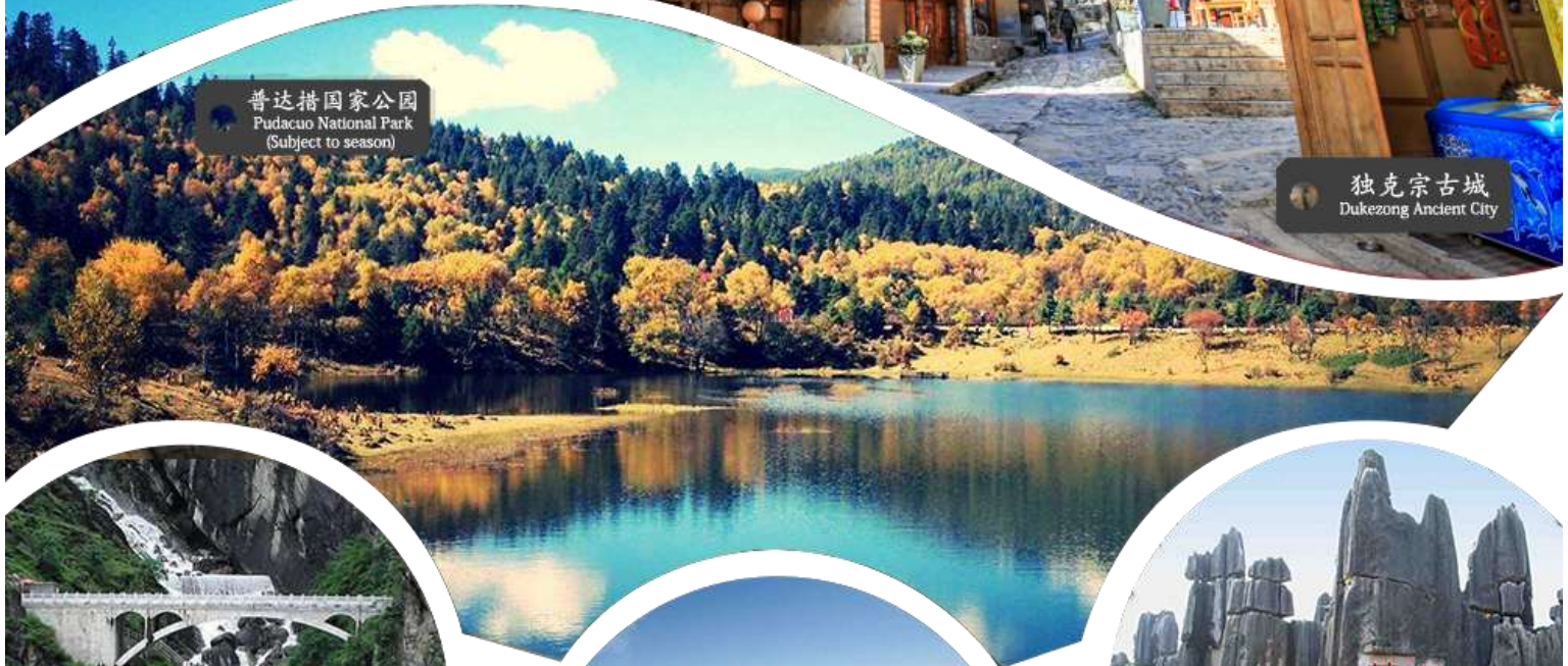
普达措国家公园 Pudacuo National Park (Subject to season)