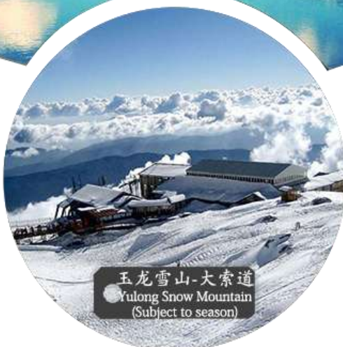
玉龙雪山-大索道 Yulong Snow Mountain (Subject to season)